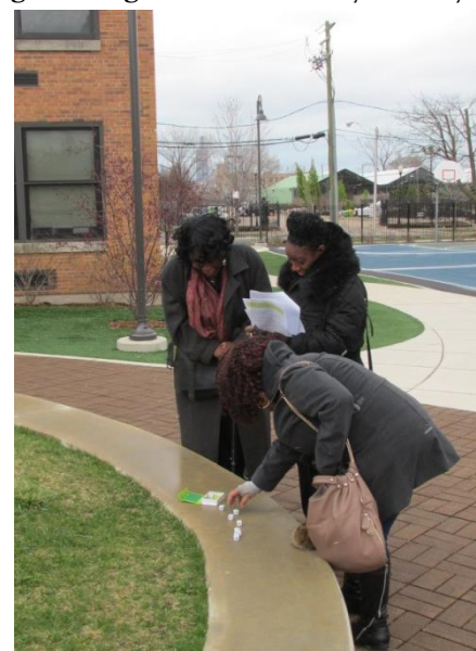
Teachers practiced using Rory's Story Cubes at the Openlands Writing in the School Garden Series